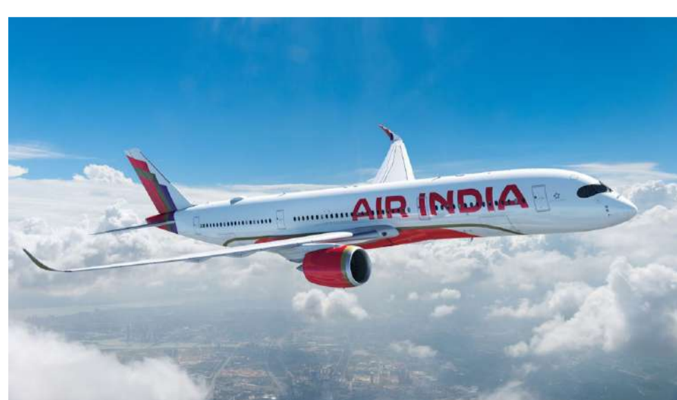
table. Flight AI310 that departs from Chhatrapati Shivaji Maharaj In-

this route will be operational again from Sept 14 with a changed time-