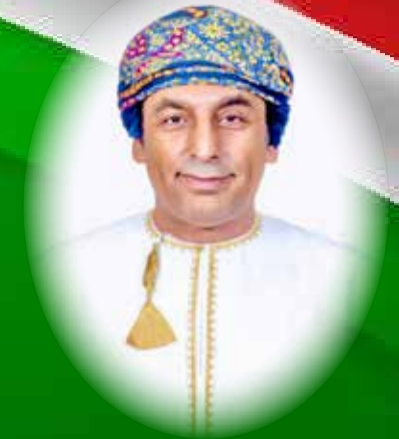
H.E. Jamil bin Haji Al-balushi Consulate of the Sultanate of Oman, Mumbai