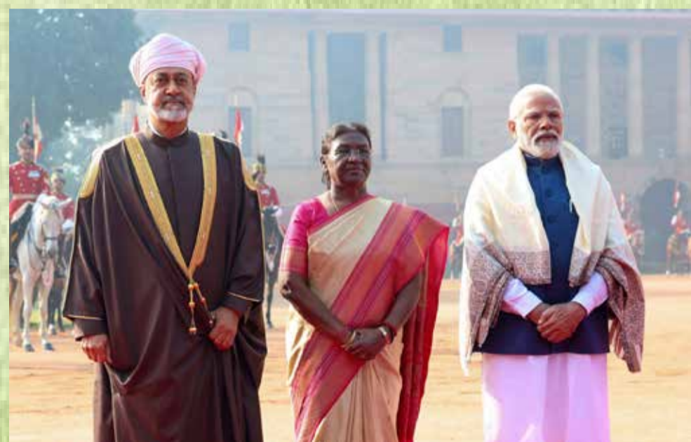
Prime Minister Narendra Modi and President Droupadi Murmu with His Highness Sultan of Oman Haitham Bin Tarik at the Rashtrapati Bhavan in New Delhi.

India and Oman share strong bilateral relations marked by shared cultural, historical and economic realities. India-Oman relationship has been on an upswing since the establishment of diplomatic ties in 1955. Oman is one of the closest strategic partners of India in West Asia. Oman's strategic location near the entry point of the Strait of Hormuz, overlooking the Arabian Sea makes it an important constituent in India's approach towards West Asia and the Indian Ocean Region.