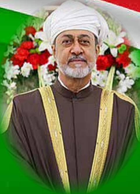
H.M. Sultan Haitham bin Tarik, the Sultan of Oman

18 TH NOVEMBER 54TH NATIONAL DAY OF OMAN