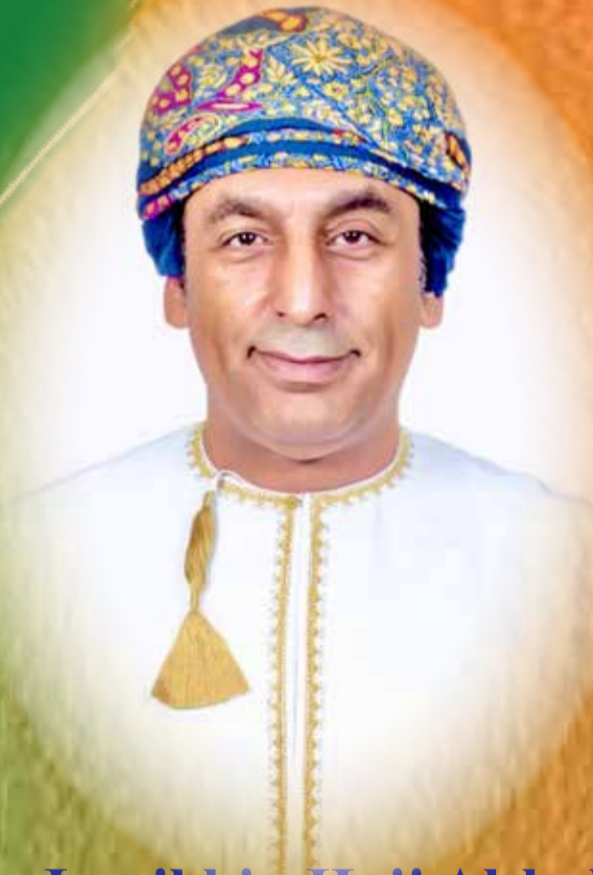
H.E. Jamil bin Haji Al-balushi Consulate of the Sultanate of Oman, Mumbai