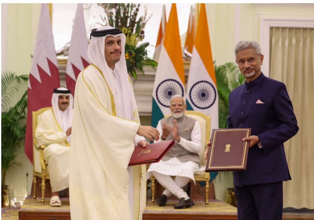
Prime Minister Modi the Amir of Qatar HH Sheikh Tamim Bin Hamad AL-Thani witnessing the Exchange of MoUs between India and Qatar at Hyderabad House in Delhi.

dia has signed a strategic partnership agreement, after UAE, Saudi Arabia, Oman and Kuwait. Modi and Al-Thani discussed the West Asia situation, reiterating their