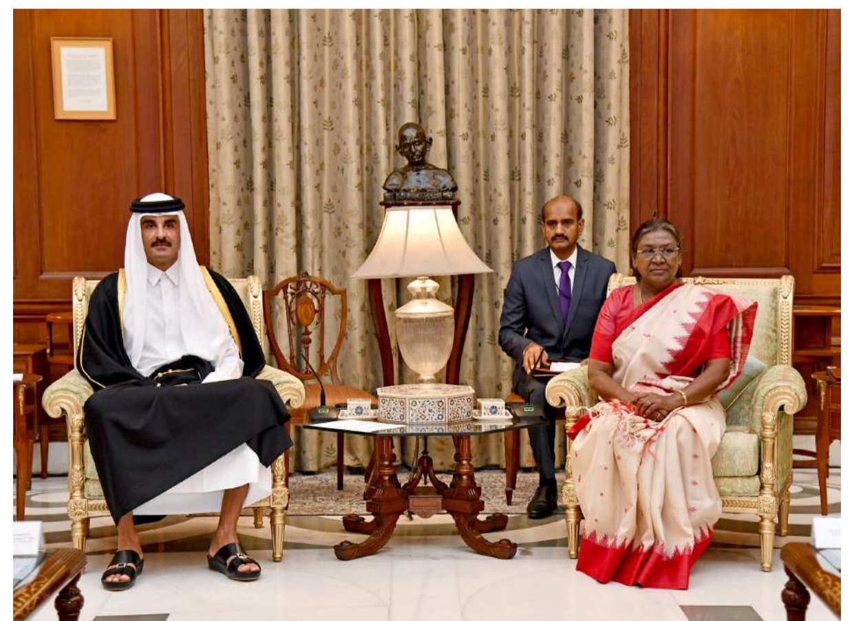
President Droupadi Murmu with Amir of Qatar His Highness Sheikh Tamim Bin Hamad Al-Thani in New Delhi .