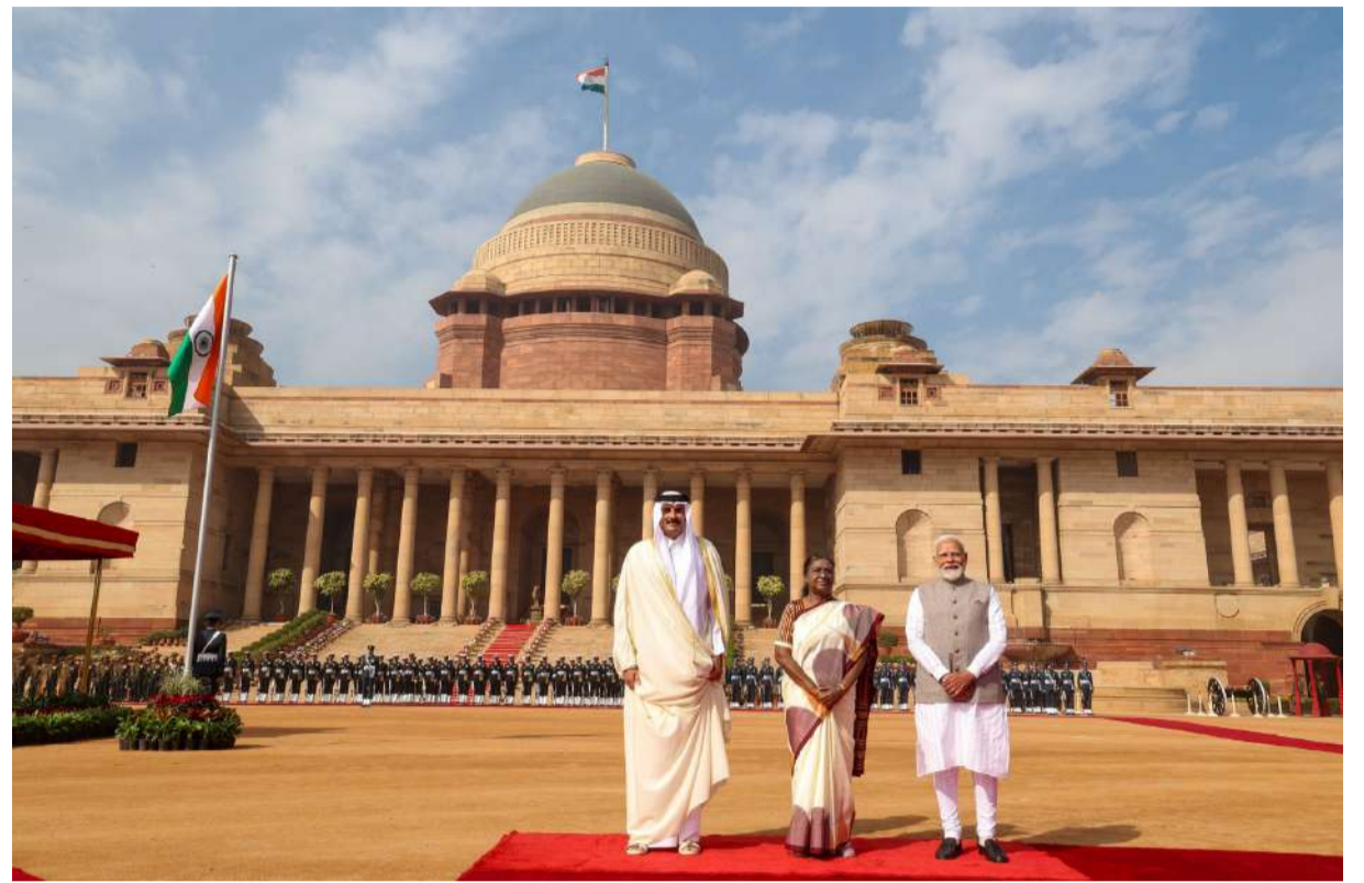
The ceremonial welcome given to the Amir of Qatar His Highness Sheikh Tamim Bin Hamad AL Thani at Rashtrapati Bhawan by President Droupadi Murmu and Prime Minister Narendra Modi.