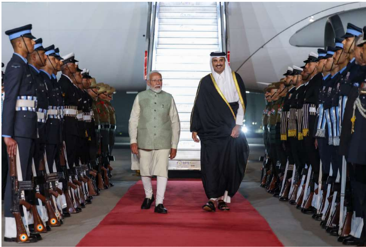
Prime Minister Narendra Modi received Amir of Qatar His Highness Sheikh Tamim Bin Hamad AL Thani in New Delhi on Monday.

MUMBAI: FRIDAY, FEBRUARY 21, 2025 • VOL. NO. 2 • Issue • No. 6. DIV. OF FLYCREATIVE ONLINE LIMITED (A unit of Creative Group) • 7 PAGES