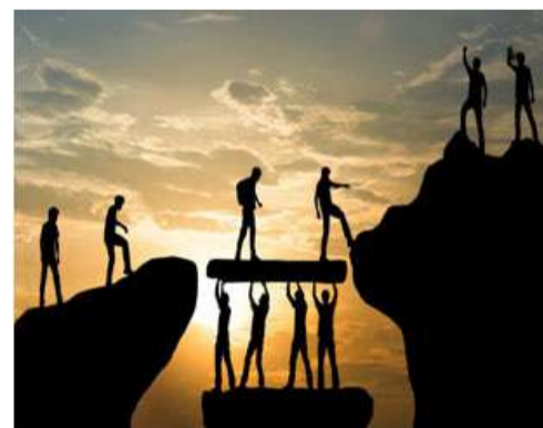
WRONG TEAM WORK

3.LEARNING OPPORTUNITY : There should be 360 Degree of learning opportunity availability to the team members. Each member could be assisted