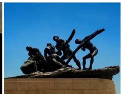
RIGHT TEAM WORK

shouldn't finger to others while they all member of the team or system. Failure also everyone should take accountability while there missed assistance or guidance between them or lack of skill in the system. The organisation's system shows the failure of goal to the individual accountabil-