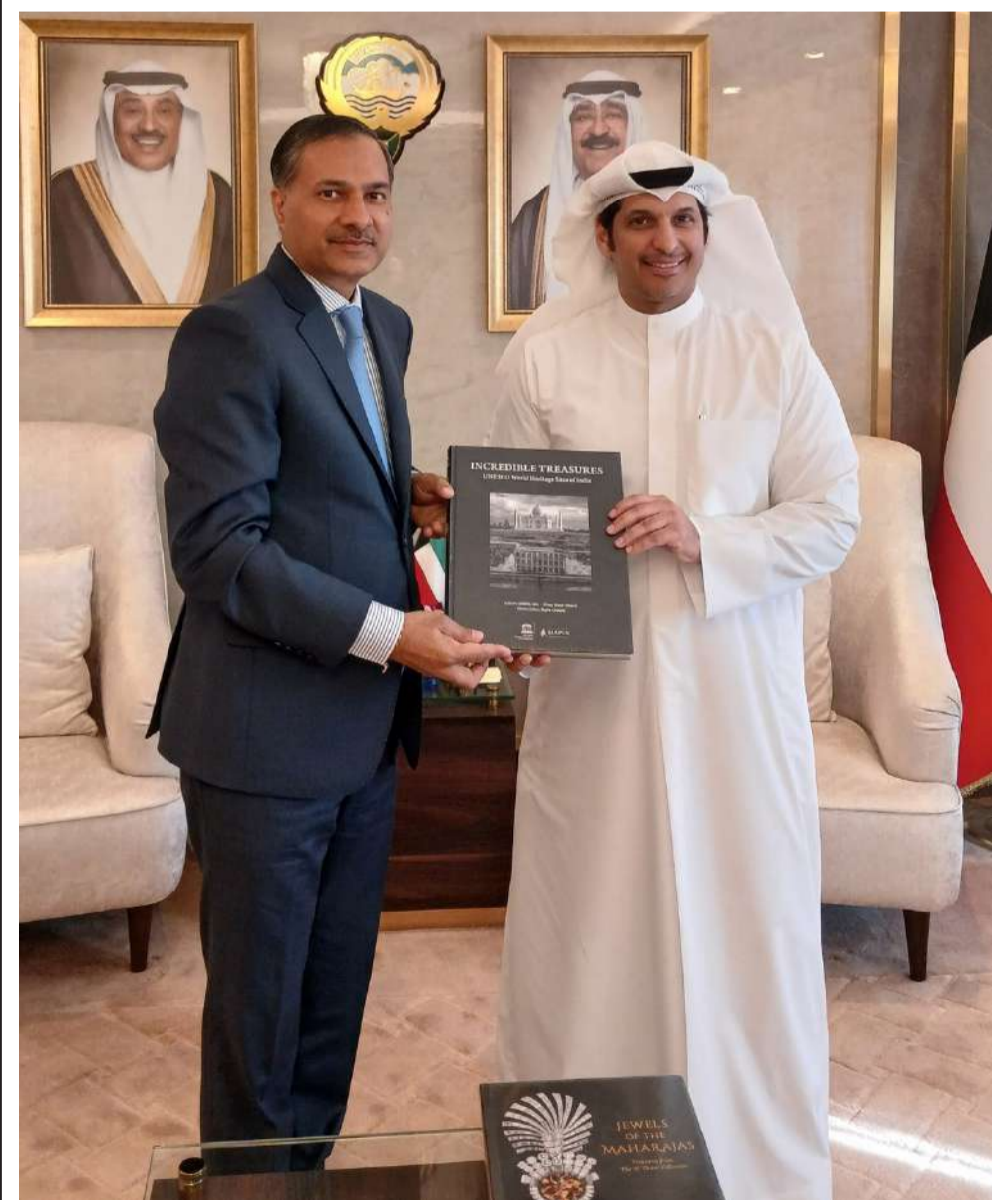
India's Ambassador to Kuwait Dr Adarsh Swaika called on H.E. Abdulrahman Baddah Al-Mutairi, Minister of Information & Culture and MoS Youth Affairs of Kuwait. The ambassador discussed proposals and sought the minister's guidance to further strengthen co-operation between India and Kuwait.

Moreover, the court, according to Article 104 of the above law, shall order suspension of a legal proceedings if it is convinced that the decision on its merits would be contingent upon the determination of any other issue, and that once such reason for suspension ceases to exist, either litigant may apply for resumption of the case. So as a principle, there is no way to stop his labour case since each subject is different from the other and there is no reason stipulated by law. But you may request the suspension on the bases mentioned in Article 104 since the decision on one case would be contingent upon the determination of any other issue and leave the matter to the court to decide.