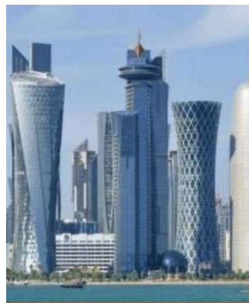
WORLD'S TOP 10 MOST COMPETITIVE JOB MARKETS

of The National's 2025 salary guide, which provides a snapshot of the state of the jobs market