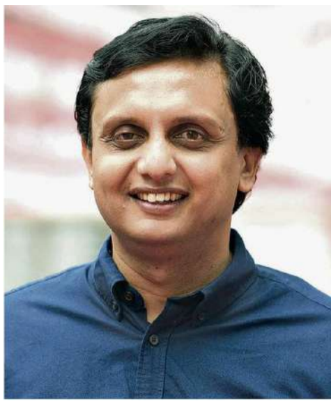
PA Mohammed Riyas addition, Kerala has been declared the best wedding destination by the maga-

K erala Tourism Minister PA Mohammed Riyas recently spoke about the future of tourism in God's own country. Addressing a conclave, Riyas talked about how Kerala rebounded after the pandemic. He said Kerala could recover extremely well from the losses it suffered by the end of 2022. "Our state has been featured in the list of 52 countries by The New York Times. In