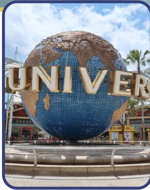
UNIVERSAL STUDIOS SINGAPORE