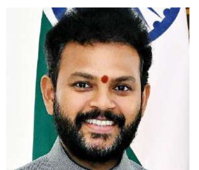
Civil Aviation Minister

"Passenger facilitation must be embedded within airport charges transparently while encouraging operational excellence," Naidu said, directing Airports Economic Regulatory Authority (AERA) to ensure accountability and improved service standards across airports through structured tariff frameworks.