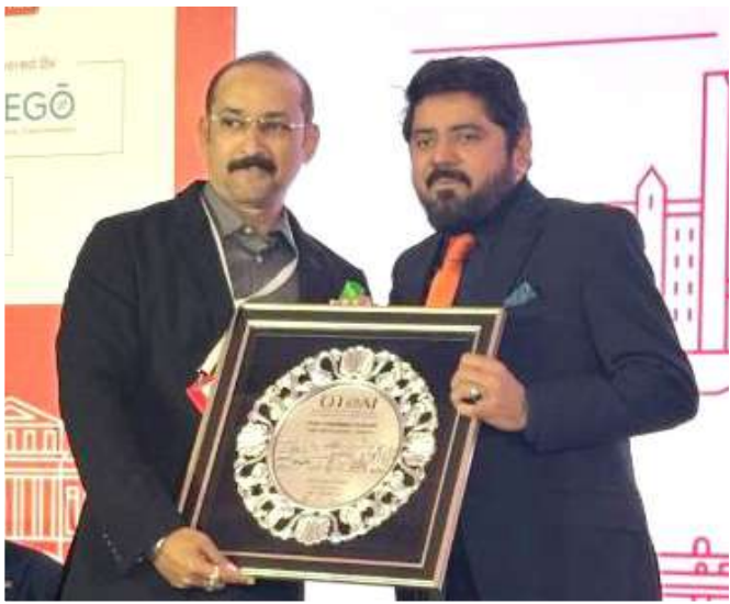
Delegates and office-bearers at OTOAI convention in Moscow.