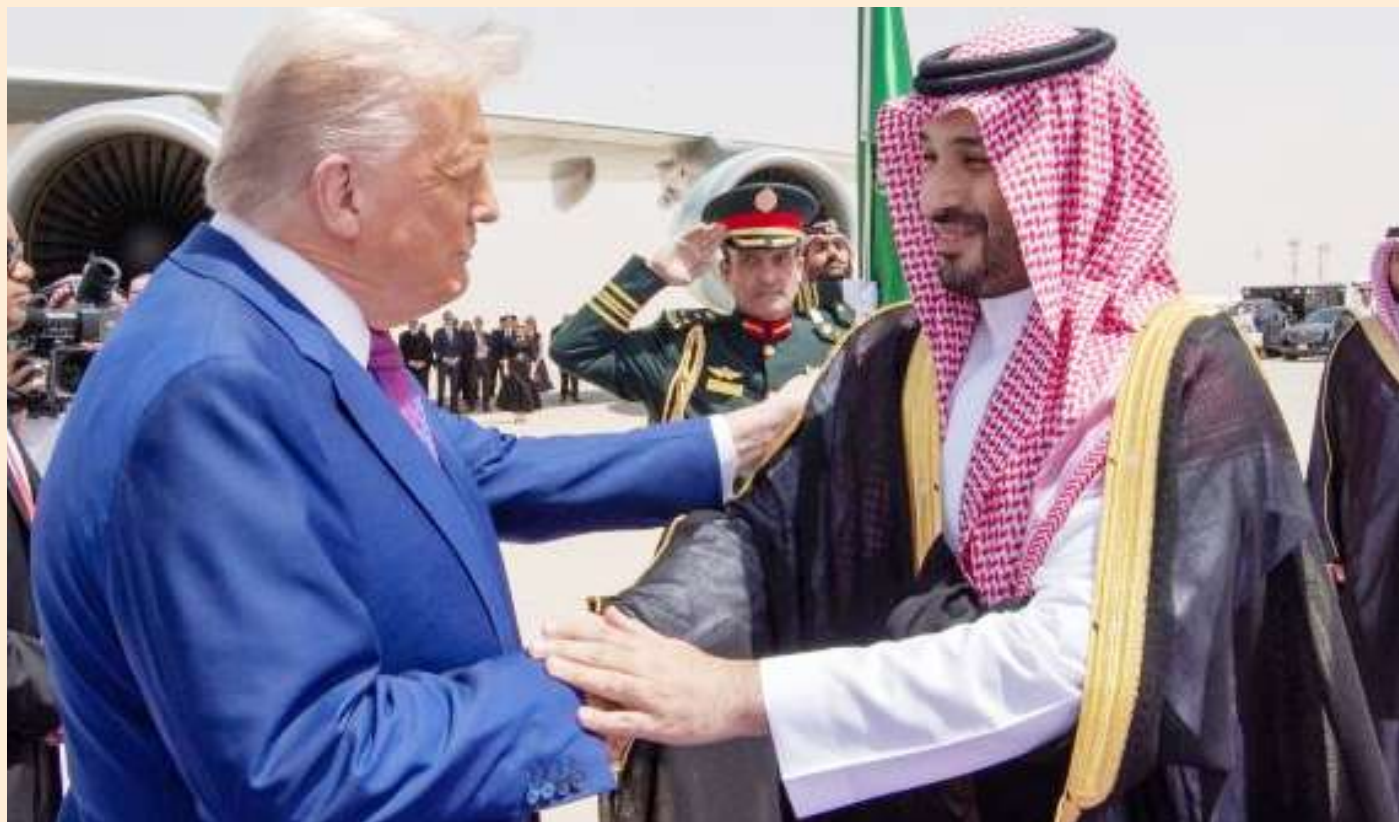
US President Donald Trump being welcomed by HH Saudi Crown Prince Mohammed bin Salman in Riyadh.