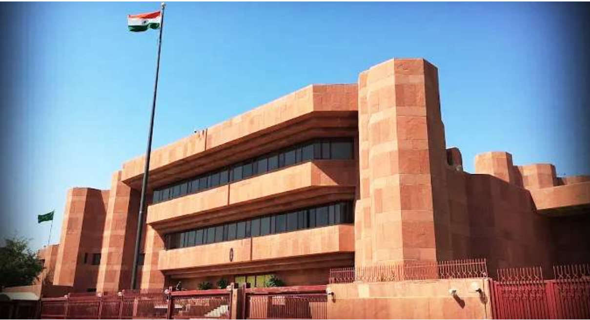
Indian embassy in Kuwait City.

KUWAIT CITY: The embassy of India in Kuwait is organising an exhibition "Rihla-e-Dosti": 250 years of India-Kuwait Relationship from May 19 to May 24, 2025 at the National Library of Kuwait. The exhibition is being jointly organised in collaboration with the National Council for Culture, Arts and Literature (NCCAL) and Kuwait Heritage Society from Kuwaiti side and National Archives of India and Ministry of information and Broadcasting of India to showcase the centuries old rich history of India and Kuwait relationship. The exhibition will highlight the enduring legacy of co-operation and shared heritage chronicling everything from early trade routes to contemporary collaborations in politics, culture and development. The exhibits include an array of invaluable artefacts, manuscripts, documents, rare books, personal letters, coins, Indian rupee (legal tender in Kuwait till 1961) and other significant items from shared past of both nations.