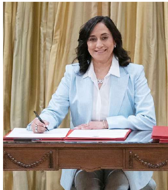
Indian-origin Anita Anand has taken charge as Canada's new minister of foreign affairs.

Anita Anand has been appointed as Canada's new minister of foreign affairs in a major Cabinet reshuffle by Prime Minister Mark Carney. The Indian-origin Liberal MP replaces Mālanie Joly, who has been reas-