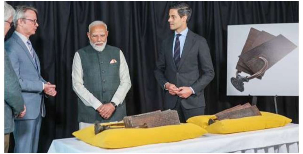
Prime Minister of Netherlands Rob Jetten handed over the Chola-era copper plates to Modi.

Rajaraja Chola-I was a Hindu emperor who provided revenue endowments for a Buddhist monastery.