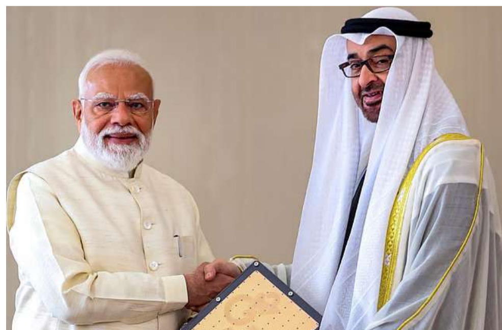
Prime Minister Narendra Modi and UAE President His Highness Sheikh Mohamed bin Zayed Al Nahyan during delegation-level talks in Abu Dhabi.