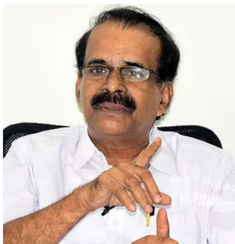
Union Minister of State for Minority Affairs George Kurian.

According to a statement by the office of Union Minister of State for Minority Affairs George Kurian, the initiative has been introduced on the request of pilgrims working in business and professional sectors who find it difficult to spend 40 to 45 days away from work. Under the new