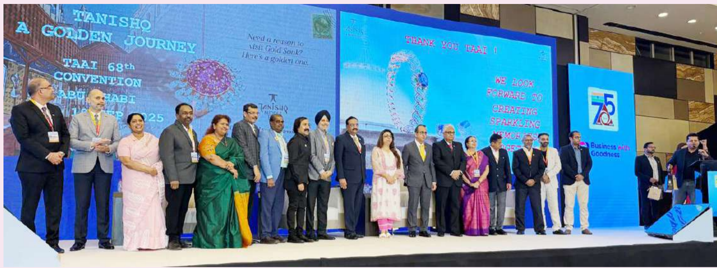
Concluding session of the TAAI 68TH convention in Abu Dhabi.