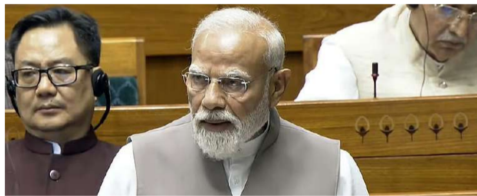
Modi addressed Lok Sabha on the war situation.

With maritime corridors facing unprecedented disruptions and the safety of Indian nationals becoming a central concern, the