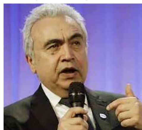
International Energy Agency chief Fatih Birol

vasion of Ukraine. "This crisis as things stand is now two oil crises and one gas crash put all together," Bi-