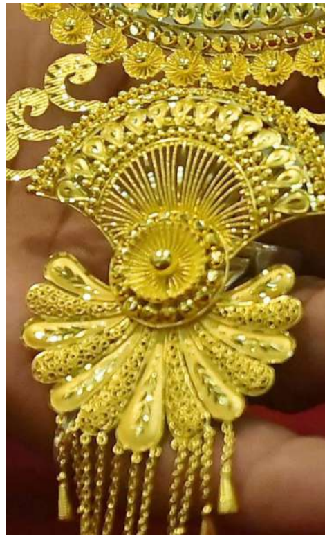
Mid East conflict involving the US, Israel, and Iran, which has stoked inflation (Cont. on page - 6)

Spot gold was trading at $4,356.48 per ounce, down three per cent. Similarly, silver fell to $66 (Dh242) per ounce, down 2.9pc in early trade. Gold has been trending downward due to the Mid-