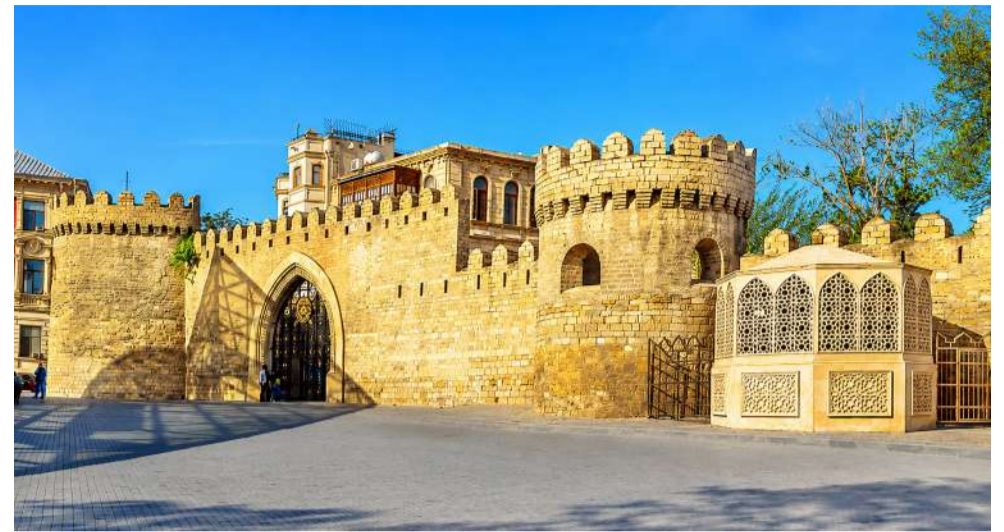
Icherisheher walls, Baku

region. Better international connectivity can help attract investment, boost trade and create new opportunities for local businesses. The new routes are also likely to encourage tourism by making it easier for international visitors to travel to Assam. For residents of the North-east, the flights will provide more convenient access to major global destinations, reducing travel time and the need for multiple stopovers.