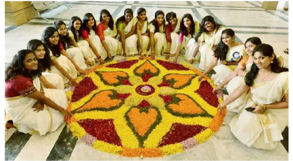
Onam flower Rangoli

we have never systematically branded the festival as a tourism product in the way West Bengal markets Durga Puja. The idea now is to make Onam itself a