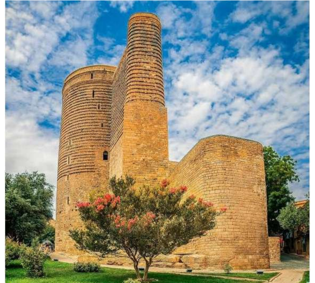
Maiden tower, Baku