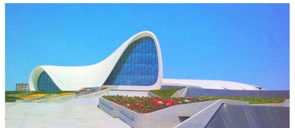
Heydar Aliyev Cultural Center in Baku