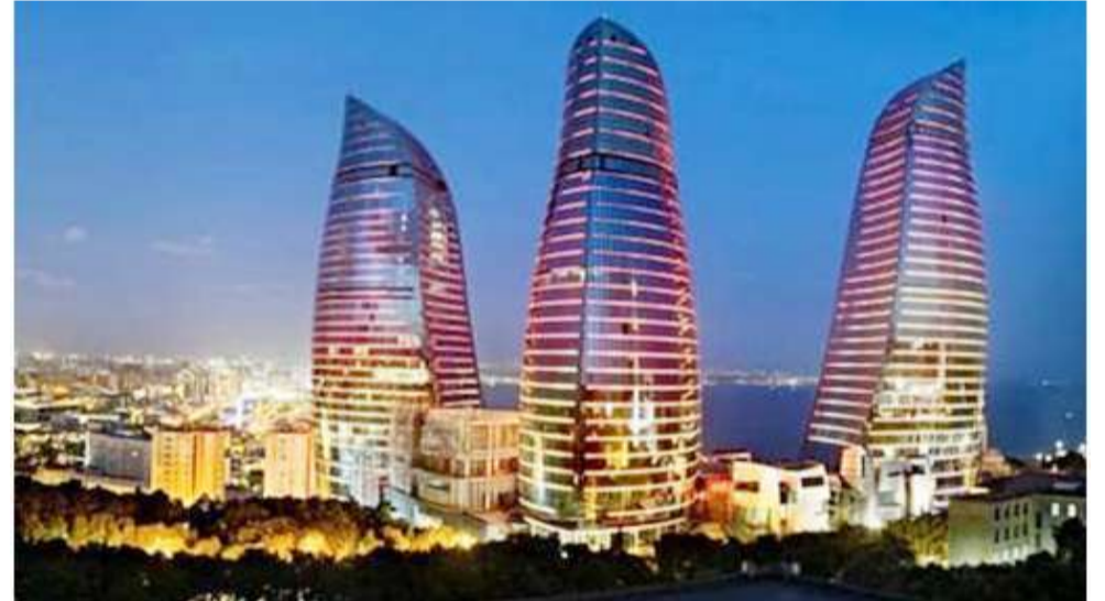
Flame Towers of Baku