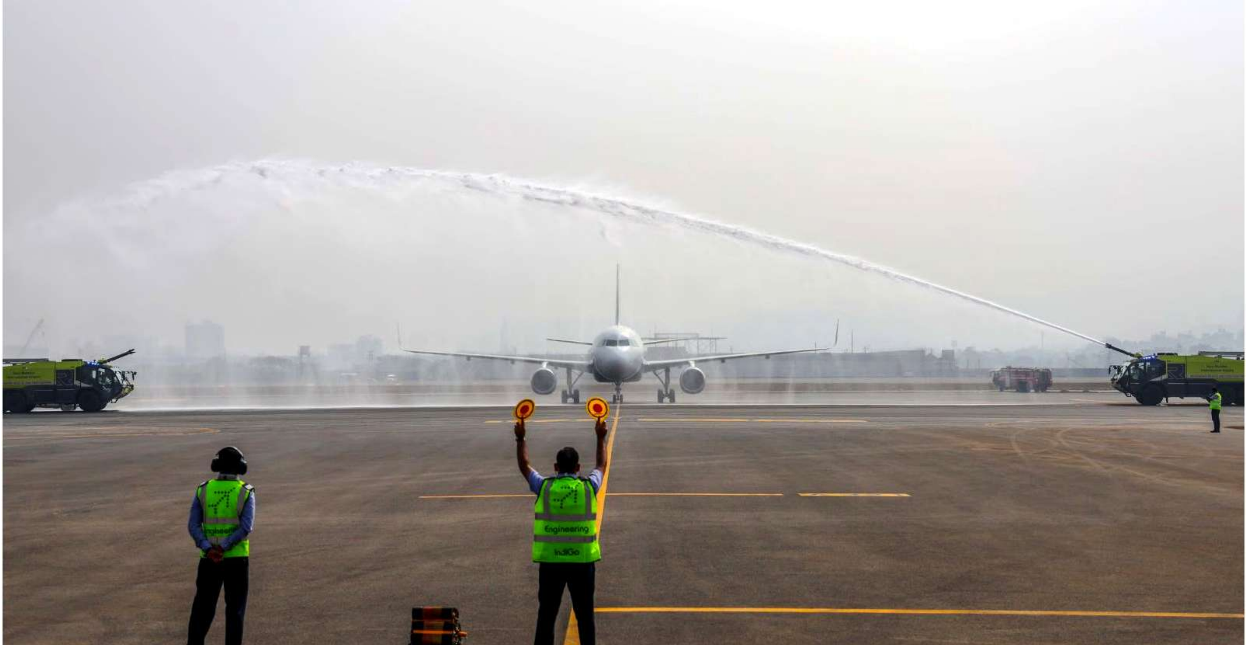
First commercial aircraft, belonging to IndiGo, landing on the runway of Navi Mumbai International Airport. The airport is now fully functional.